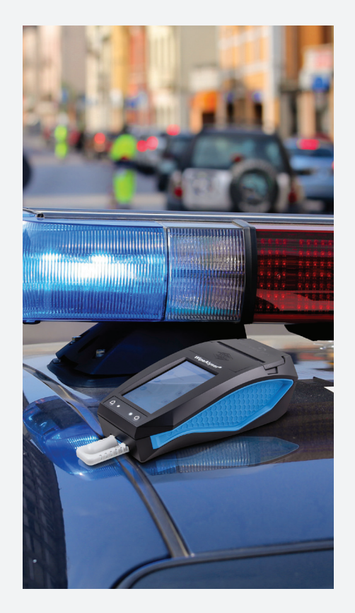
WipeAlyser® Portable Analysis Device (for DrugWipe S only)

DrugWipe A test cassette has multi-purpose testing capabilities; sweat, saliva, surfaces—it can test them all! This screener is well suited for situations where error is not an option.