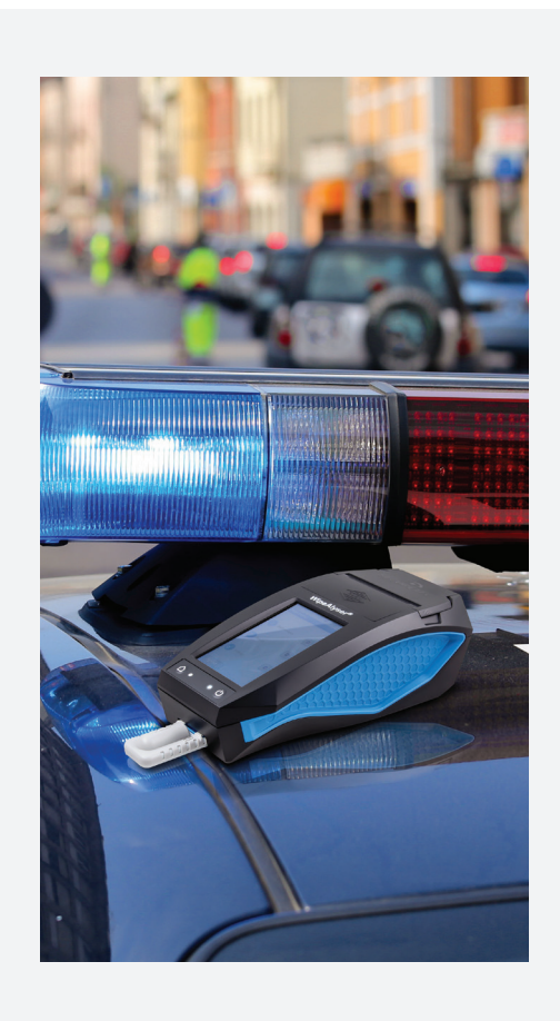
WipeAlyser® Portable Analysis Device (for DrugWipe S only)

DrugWipe A test cassette has multi-purpose testing capabilities; sweat, saliva, surfaces—it can test them all! This screener is well suited for situations where error is not an option.