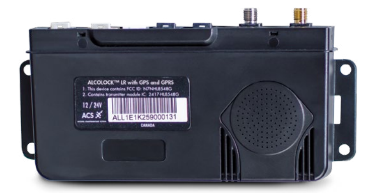
ALCOLOCK LR with GPS and GPRS

Data transfer protocols can be sent either real-time or at a programmed frequency (e.g. daily).